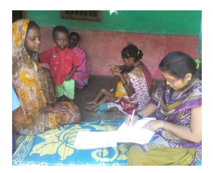
Figure 1 Knowledge on reproductive health between rural and Siddi tribal mothers